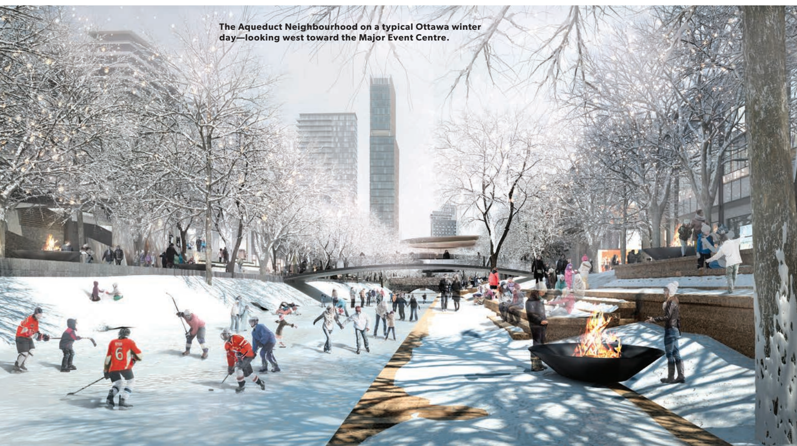
The Aqueduct Neighbourhood on a typical Ottawa winter day—looking west toward the Major Event Centre.