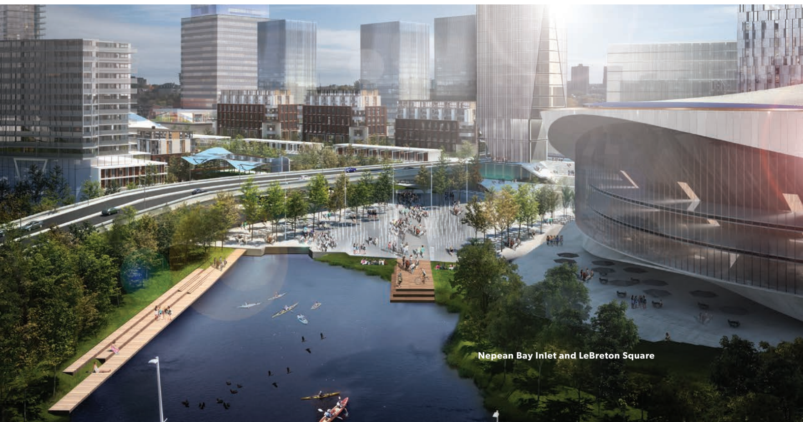
Nepean Bay Inlet and LeBreton Square

The public anchor uses and public realm of IllumiNATION LeBreton serve each other, creating an unparalleled synergy that makes the development a major public asset and a call to the world to visit.