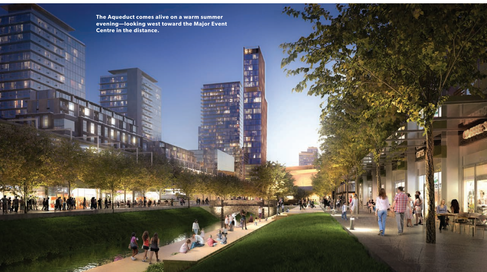
The Aqueduct comes alive on a warm summer evening—looking west toward the Major Event Centre in the distance.

The successful completion of this project will effectively remove the financial burden of approximately 1.2 million cubic metres of contaminated soil liability from the Federal government and Canadian taxpayer, while making all 21 hectares available for development. This remedial approach will also result in the elimination of the on-site contamination sources that are discharging to the Ottawa River and remove the on-going safety considerations and greenhouse gas concerns with respect to the landfill gas. Remediation is just the first step in transforming this site into one of the most sustainable developments in Canada.