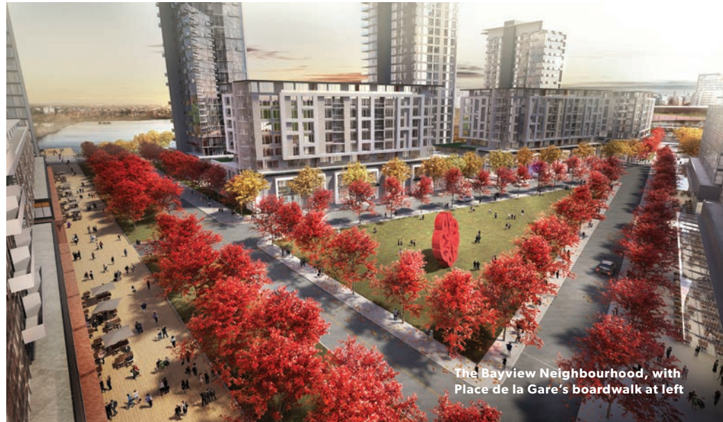
The Bayview Neighbourhood, with Place de la Gare's boardwalk at left

By supplementing the popular cultural events already taking place on LeBreton Flats with new entertainment venues, public spaces, and experiential street activity, IllumiNATION LeBreton will become a prominent and dynamic entertainment destination, known throughout the world.