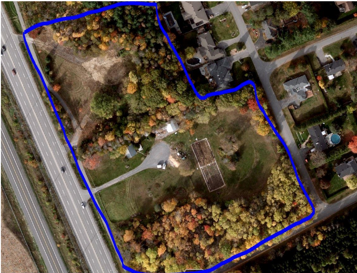
Aerial view of both properties