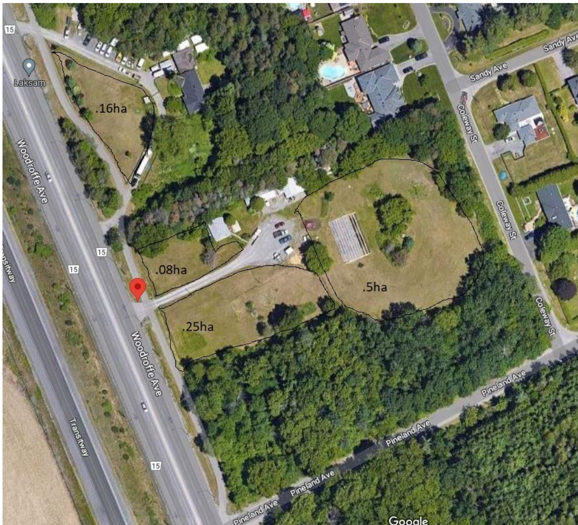
Aerial view with land sizes, house and pavement in the northern land parcel have been removed