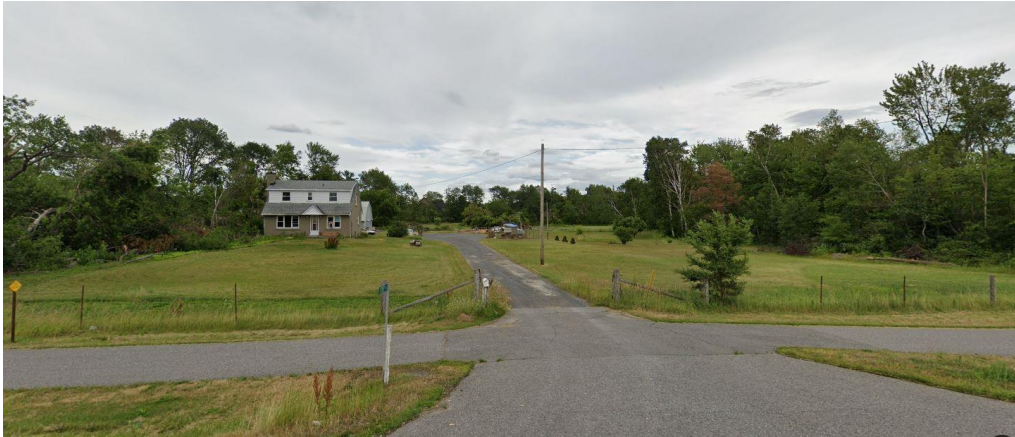
View from Woodroffe Ave (including bike path)