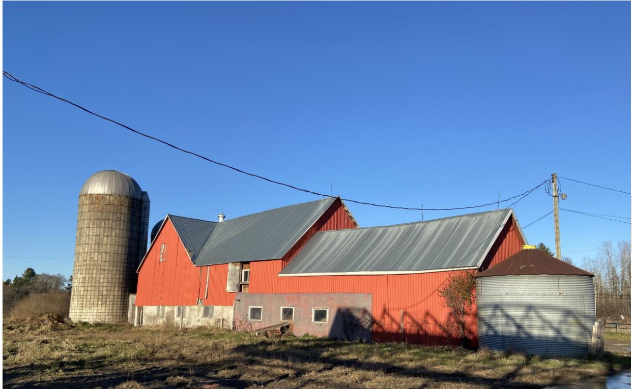
View of equestrian barn