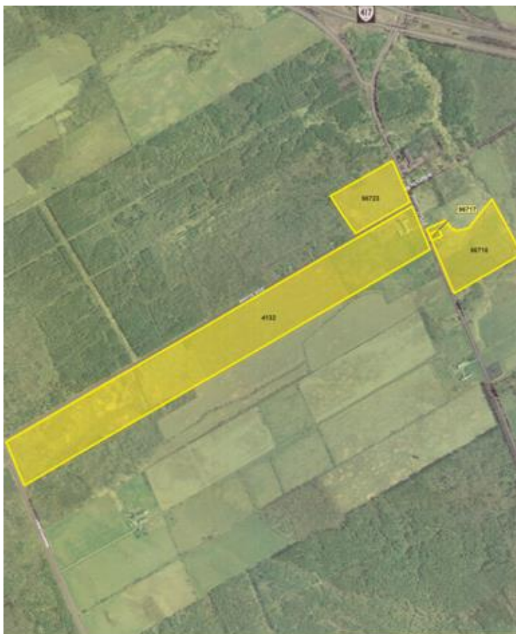
Aerial view of lease area