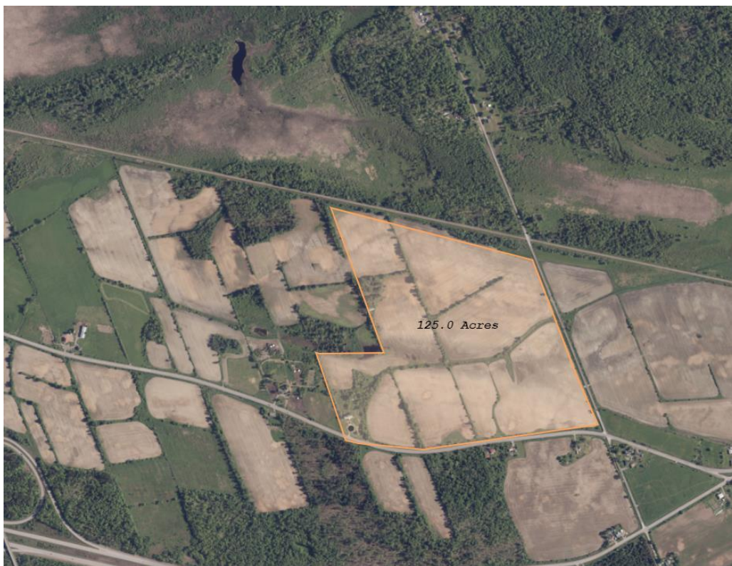
Aerial view of potential lease area