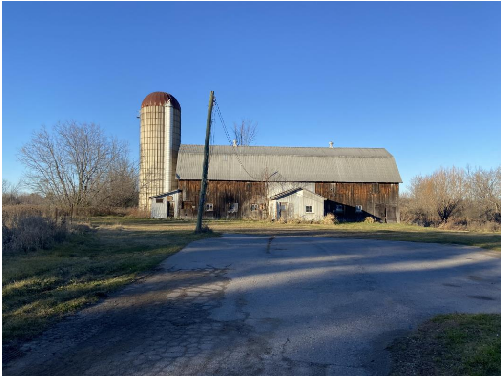
View from Russell Rd