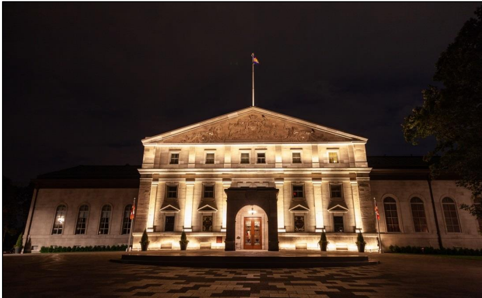
Rideau Hall façade lighting implementation