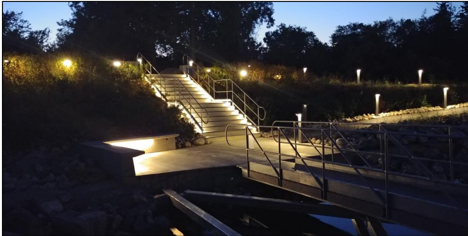
Richmond Landing lighting implementation