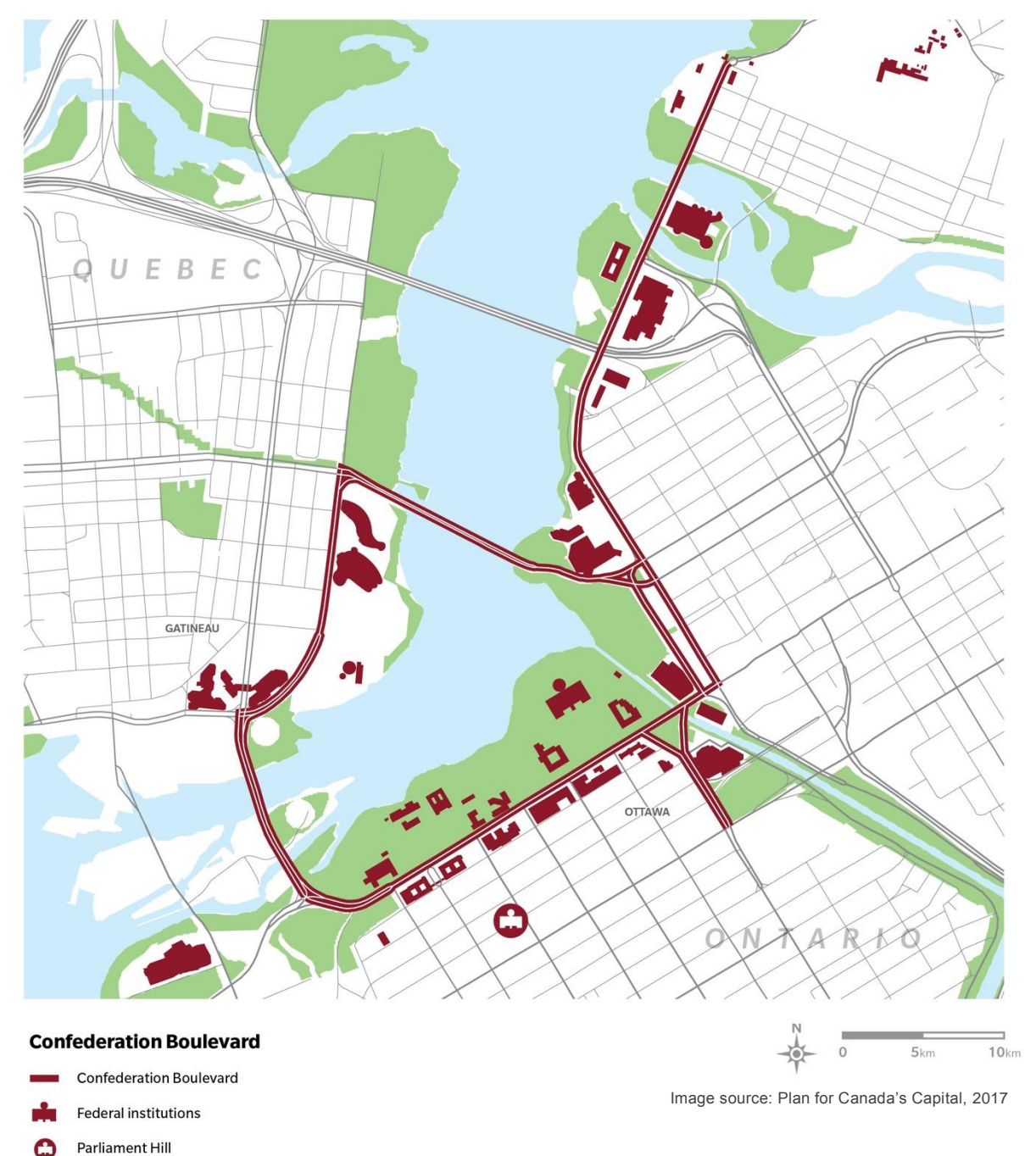
Figure 2: Map of Confederation Boulevard

Proponent's Guide to the NCC's Federal Land Use, Design and Transactions Approval Process