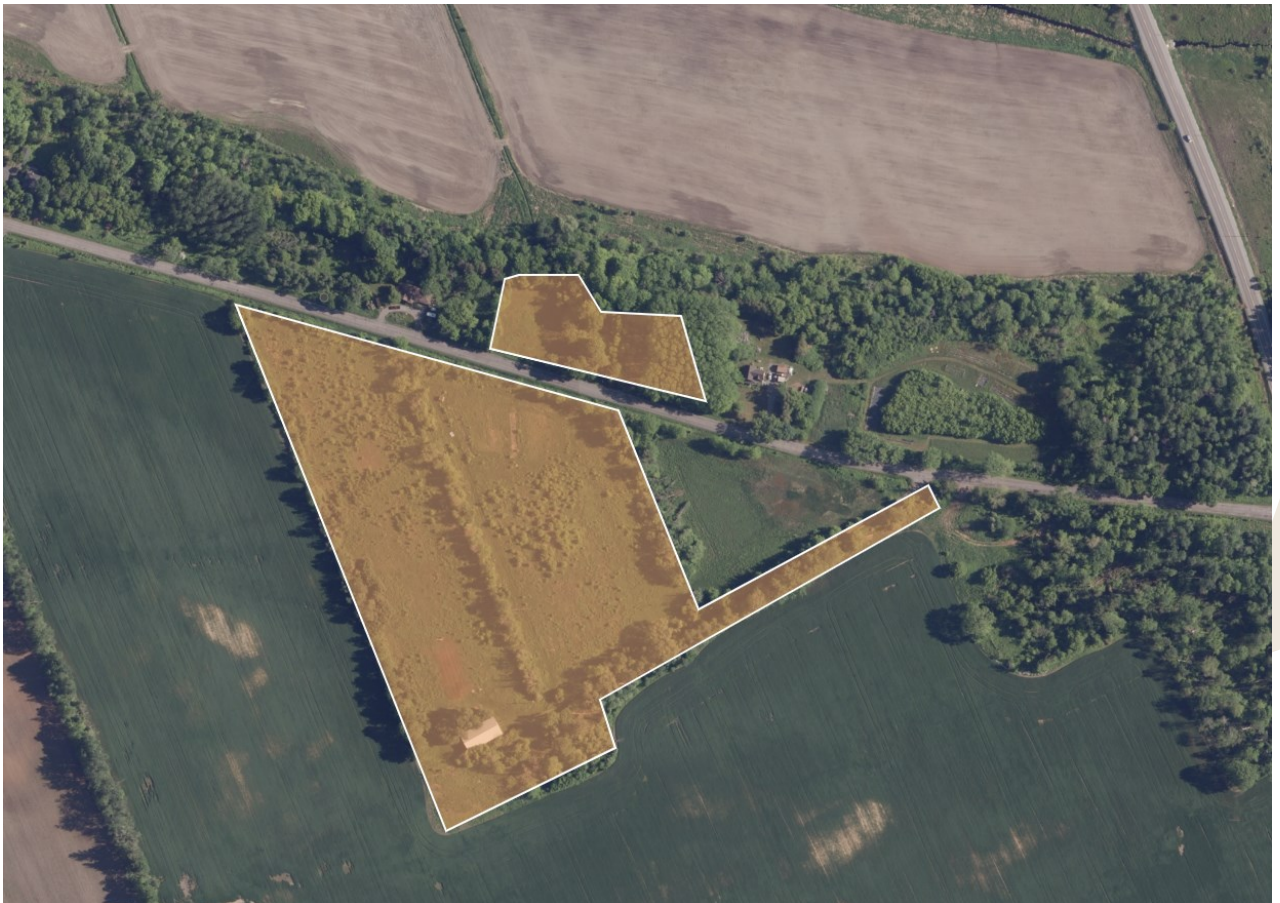
Aerial view of lease area