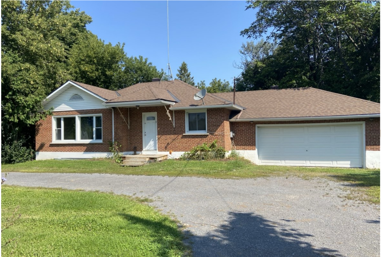
View of Farmhouse from Ridge Road